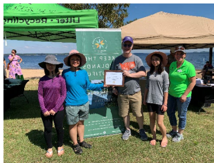
McGregor Presbyterian Church Representatives