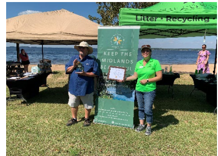
Midlands Sierra Club