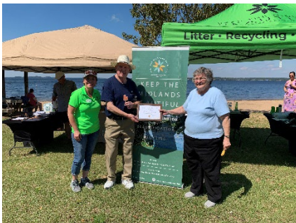
The Dunster Family