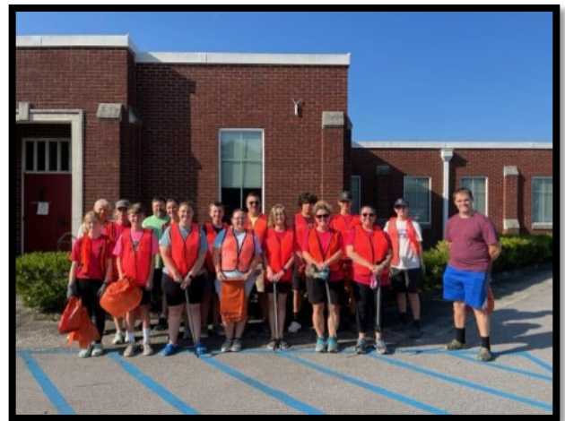
Mt. Hermon Lutheran Church