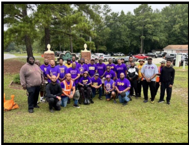
Omicron Phi Chapter