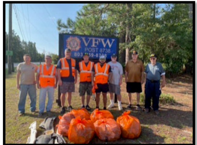
Lexington VFW 8739