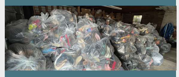
It might be hard to believe but this is not even half of our shoes in our garage!

With help from 20 organizations , we collected 5,325 pairs of reusable shoes for people in developing countries this spring. This program helps us to earn some money for our programs while keeping donated shoes out of local landfills and helps micro-enterprises to support their families.