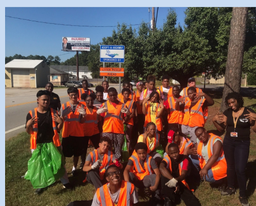
How many people volunteered?

After each cleanup please submit a report card to us online through our website or by email . We really like to see how much trash was cleaned up and read about how much fun your group had doing it!