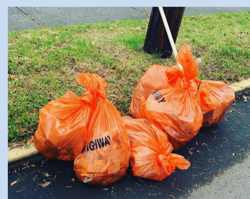
How many bags were collected?