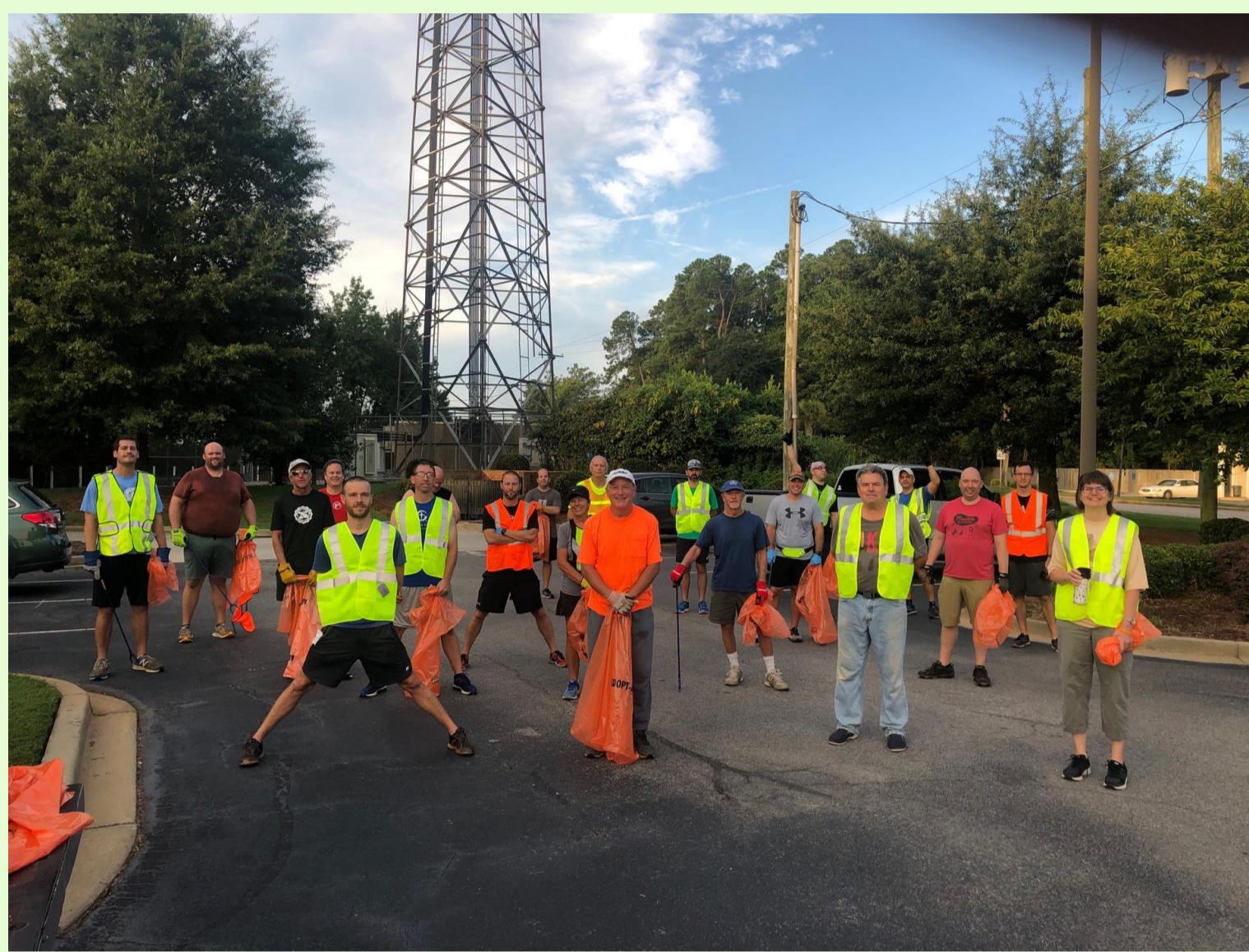
Thank you Ballentine Civic Association AAH Group for Keeping the Midlands Beautiful!

After registering, you will receive a confirmation email containing information about joining the meeting.