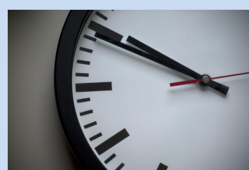
How long was the cleanup?

After each cleanup please submit a report card to us online through our website or by email . We really like to see how much trash was cleaned up and read about how much fun your group had doing it!